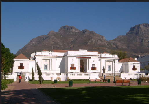
Iziko National Gallery