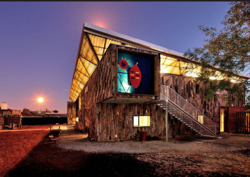
Guga Sthebe Theatre