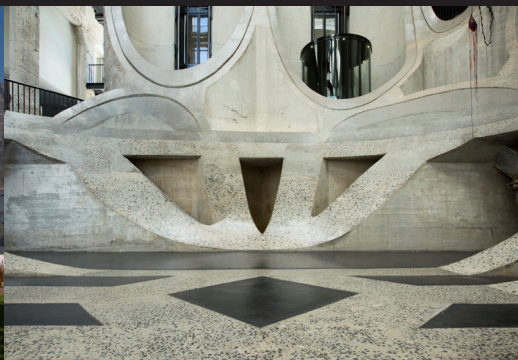
Zeitz MoCAA Museum